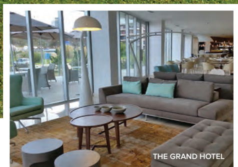
THE GRAND HOTEL