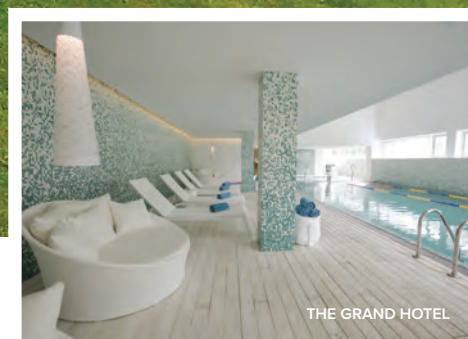
THE GRAND HOTEL