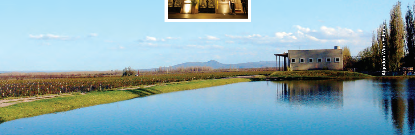
Algodon Wine Estates